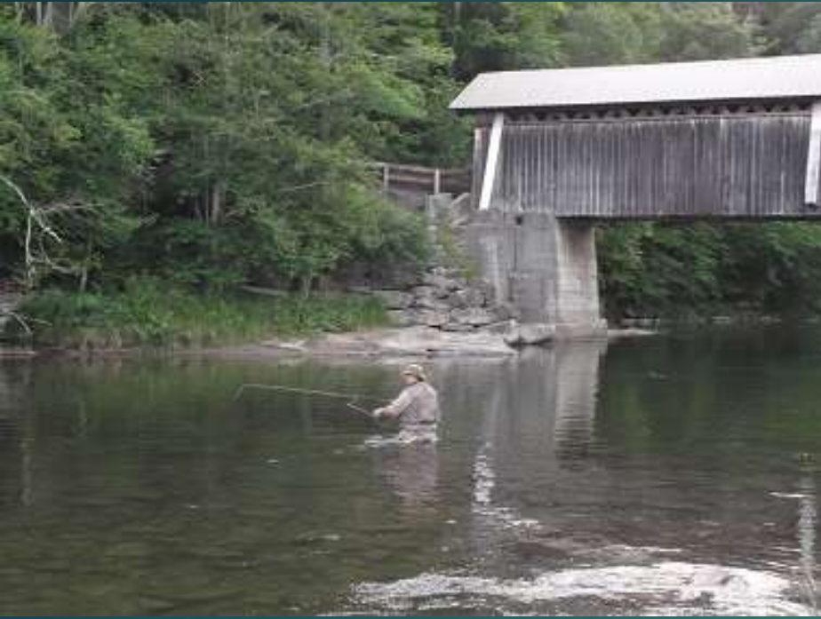
The Beaverkill River Roscoe NY